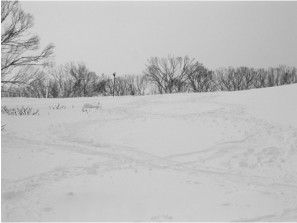
Figure 8's on the Home Slope

Bogong Rover Chalet PO Box 774 Mt Waverley 3149