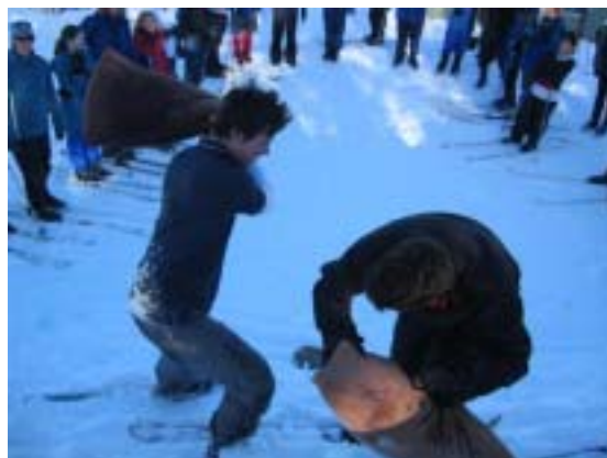
S.A. Snow Venture Pillow Fights

Bogong Rover Chalet PO Box 774 Mt Waverley 3149